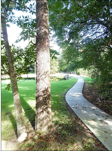
Jay and Vicki Brooks 4756 Elm Shadow Drive, 70817

leaf mahonia, ligularia, gold dust acuba and bicolor iris add interest to the lush southern beds that also include magnolias, river birch, crape myrtle, Japanese maple and 'Forest Pansy' redbud trees.