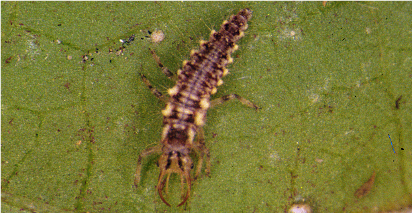
Figure 3. Larva of species C. rufilabris .

and Chrysoperla . There are six species reported in Louisiana: Abachrysa eureka , Chrysopa quadripunctata , Chrysopa oculata , Chrysoperla rufilabris , Leucochrysa insularis , and Nodita pavida .