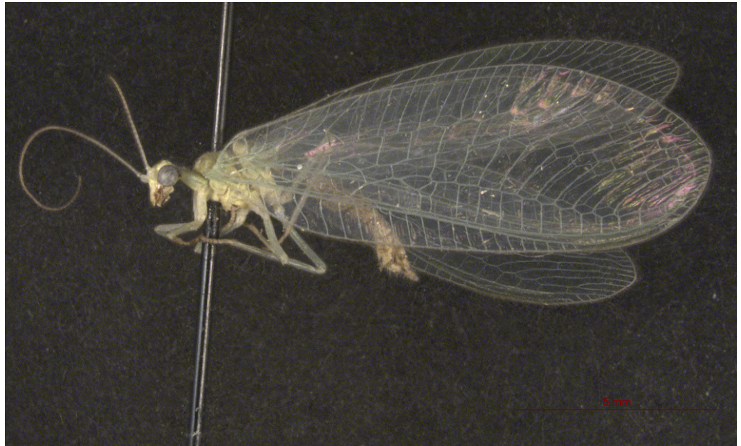
Figure 6. Adult green lacewing from unknown species.

Green lacewings are reared commercially in insectaries for the use in augmentation biological control. The release of green lacewings as eggs, larvae, or adults can be very effective for control of pests in greenhouses or small vegetable gardens. These predators have been utilized for the control of many common pests, such as Colorado potato beetle, flea beetles,