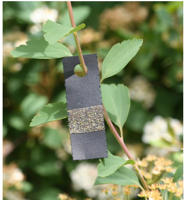
Fig. 8. Card containing Chrysoperla spp. eggs for biological control of aphid infested shrub.