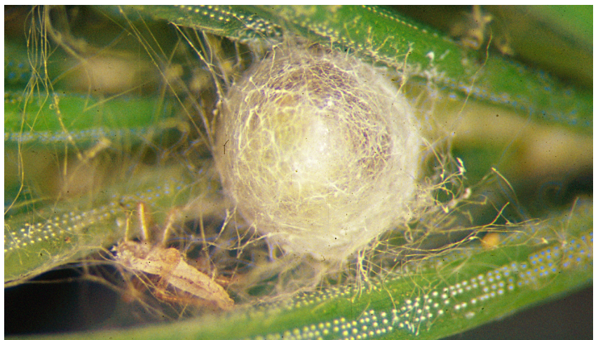
Figure 5. Green lacewing larva preparing to pupate. Laurens County, Georgia.