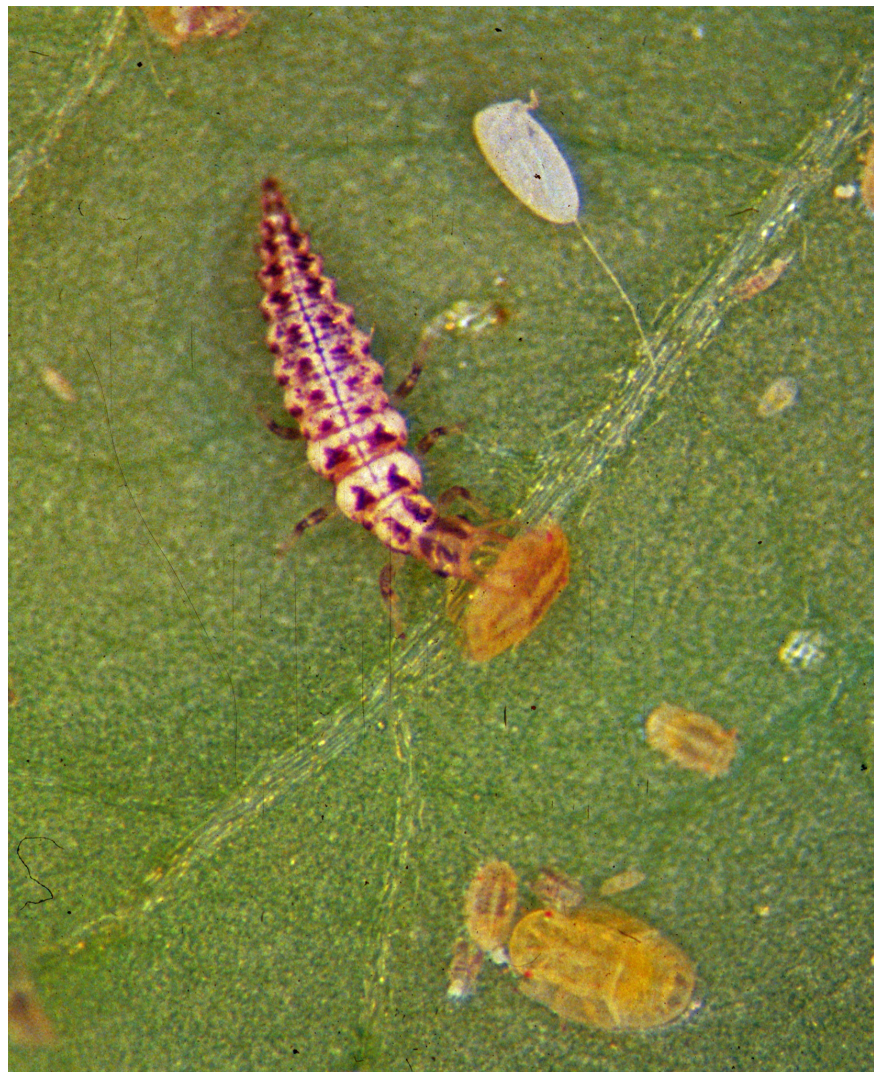
Fig. 7. C. rufilabris larva preying on potato psyllid nymph with Chrysoperla egg in the background.