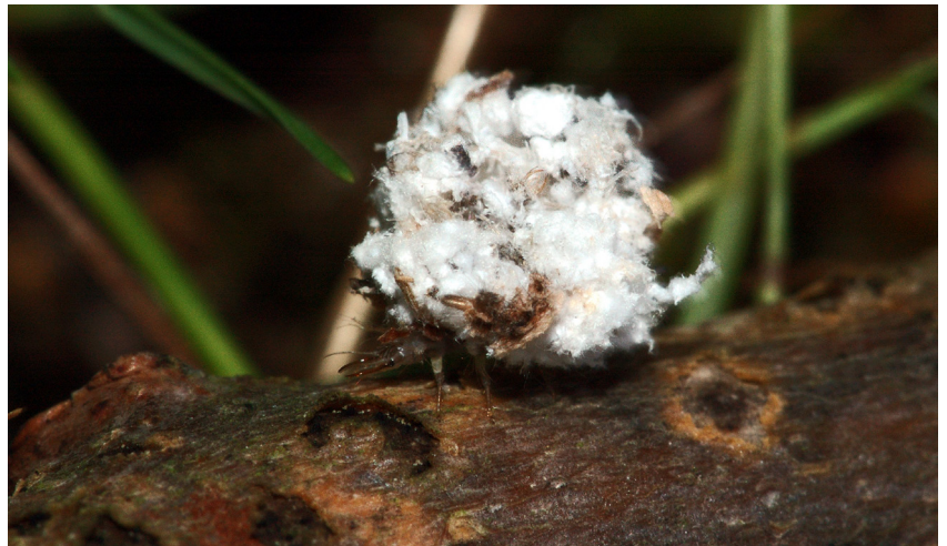
Figure 4. Debris carrying green lacewing larva from Lee County, Florida.

Adult green lacewings are usually green and soft bodied, with copper colored eyes and long thread-like antennae. The wings are translucent and lacy (Figure 6).