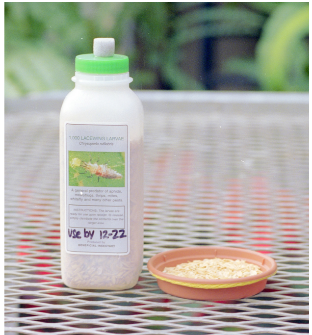
Fig. 9. Bottle containing commercially available Chrysoperla rufilabris larvae for biological control.