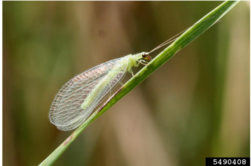
Figure 1. Adult green lacewing, Chrysopa sp.

Green lacewings are found widespread throughout North America. There are 87 species in 14 genera recorded from the U.S. and Canada. Many of the species found in North America are members of the genera Chrysopa